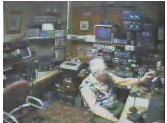
Gale, W7AMQ operates during a Monday evening net

RSVP for Pizza on the net or by leaving message on 241 8663.